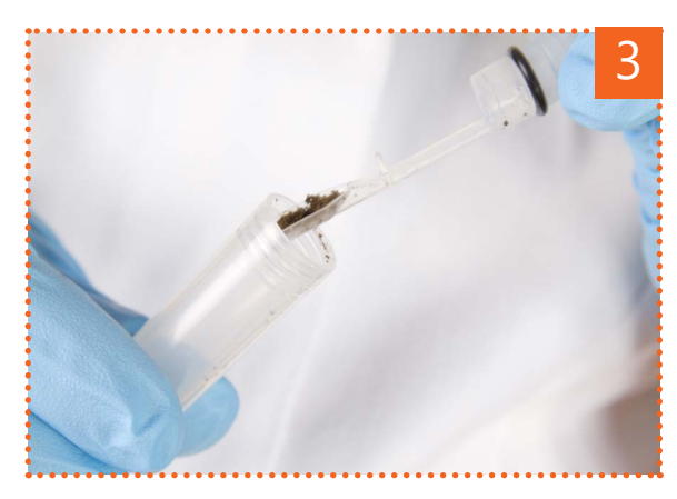
■ Dilute its content in the liquid of the small tube called sample