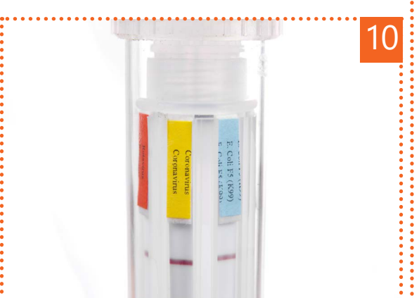
After 10 minutes, read the results using picture 11 as standard.

The liquid contained in the sample tube moves to the strip tube and slowly migrates along the strips.