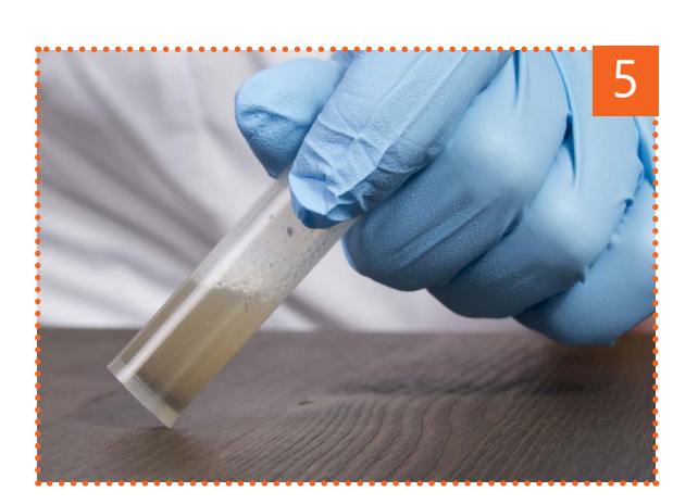
■ Tap the sample tube on a hard surface so that all the liquid is collected at the bottom of the tube.