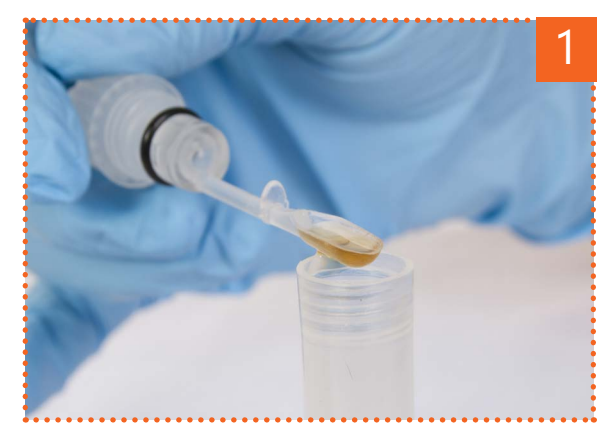
■ Take the faeces directly from the rectum of the calf. If the samples are liquid, take a spoonful.