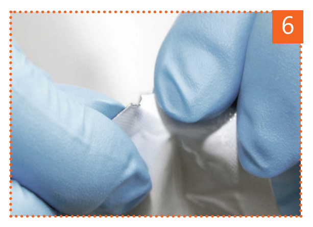
■ Tear the aluminium envelope open at the notch. Once the device has been taken out of the envelope its stability is of short duration, especially in a humid environment.